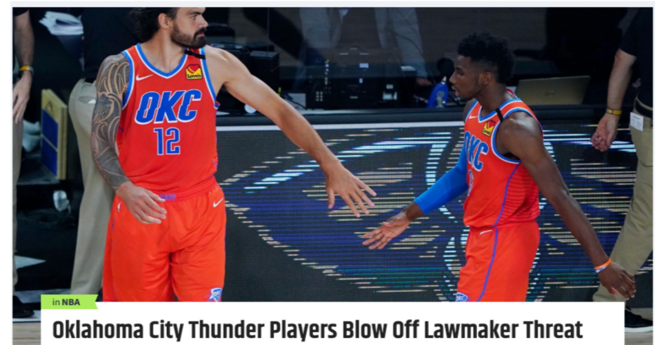
Oklahoma City Thunder Players Blow Off Lawmaker Threat and Kneel During Anthem

Oklahoma City Thunder players blew off a lawmaker's threat and continued to kneel for the national anthem Saturday.